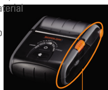
Damage-resistance material Rubber over-molding