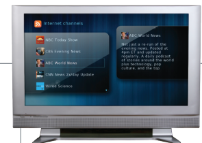
➔ Podcasts, RSS feeds, Flickr, and more...