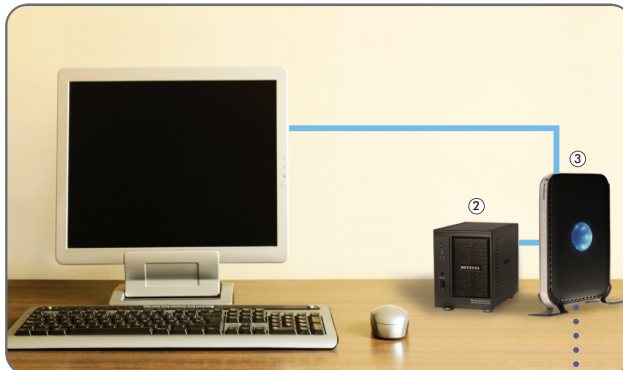
2. Network attached storage (ReadyNAS® Duo) 3. Wireless-N Router

Connect your Digital Entertainer Elite to your home network via Wireless, Wired Ethernet, Powerline, or MoCA (Coax Networking).