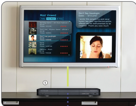
1. Digital Entertainer Elite