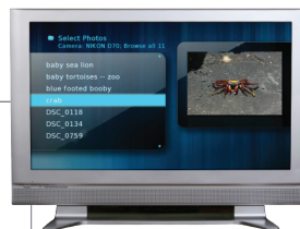
➔ Listen to music while you watch a photo slideshow