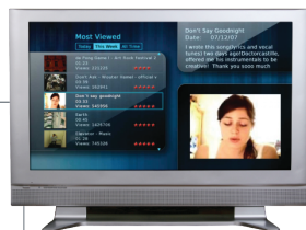
➔ Enjoy Internet video on the big screen from your couch