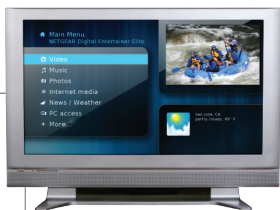
➔ All of your videos, music, and photos at your fingertips