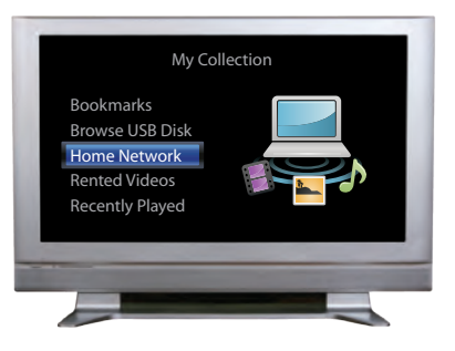
My Collection: Home Network - Play movies, photos or music stored on home computers and network storage.