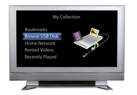
My Collection: USB Disk - Easily select and play personal media stored on external USB drives.