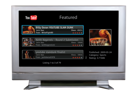
YouTube™ - Enjoy YouTube directly on your TV without needing a computer.