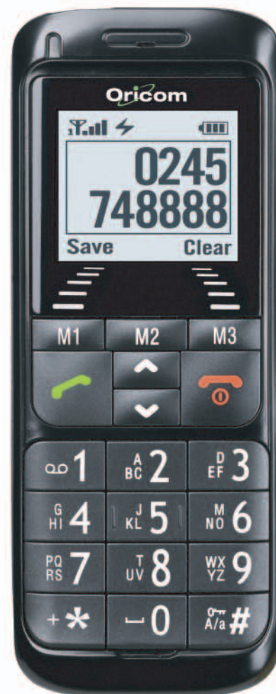
IMAGE SHOWS ACTUAL SIZE

The large easy to read display and high visibility buttons make the Oricom ezy100 the perfect mobile phone for seniors and those suffering from hearing loss and or low vision.