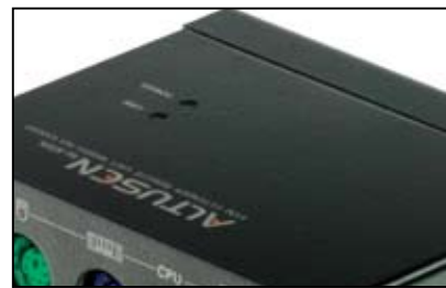
■ LED Status Display